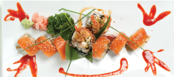
SM10. CRAZY MAKI