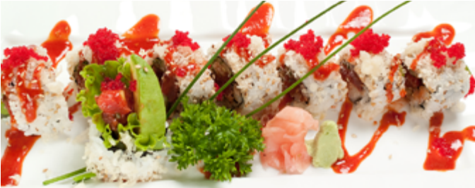
SM5. SUPER KAMIKAJE MAKI