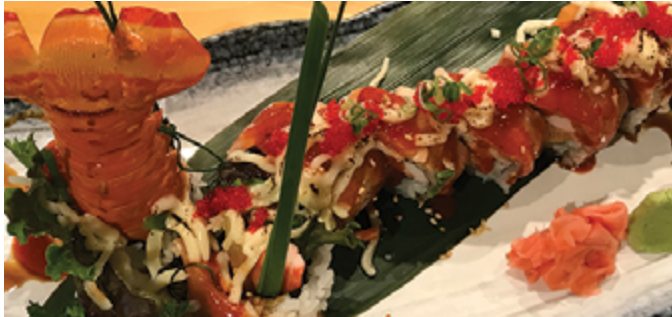
SM13. DANCING LOBSTER MAKI