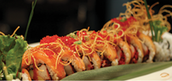
SM14. UPPER BEACH MAKI