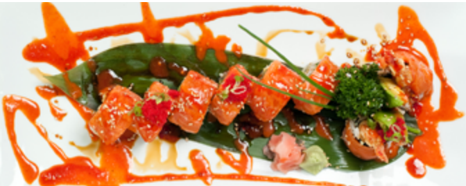
SM1. EAST END MAKI