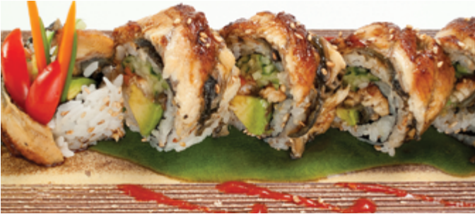
SM4. UNAGI DRAGON MAKI